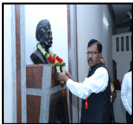
Arrival of the Guests into the college premises honoring the keshav koratkar statue with garland