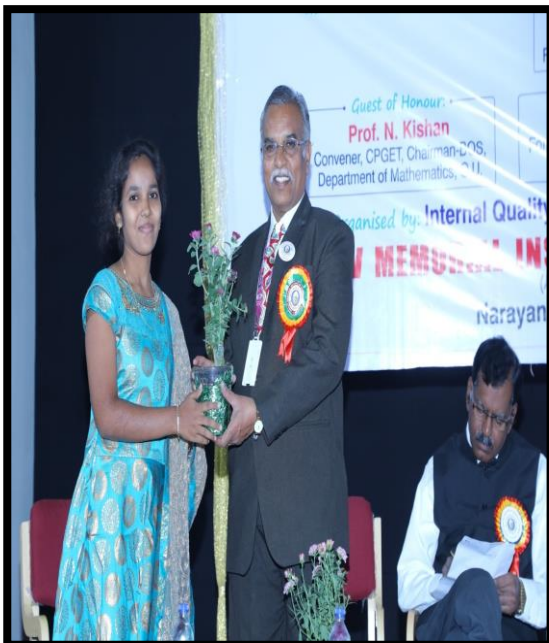
Management were invited on to the dias and honored by presenting plant saplings.