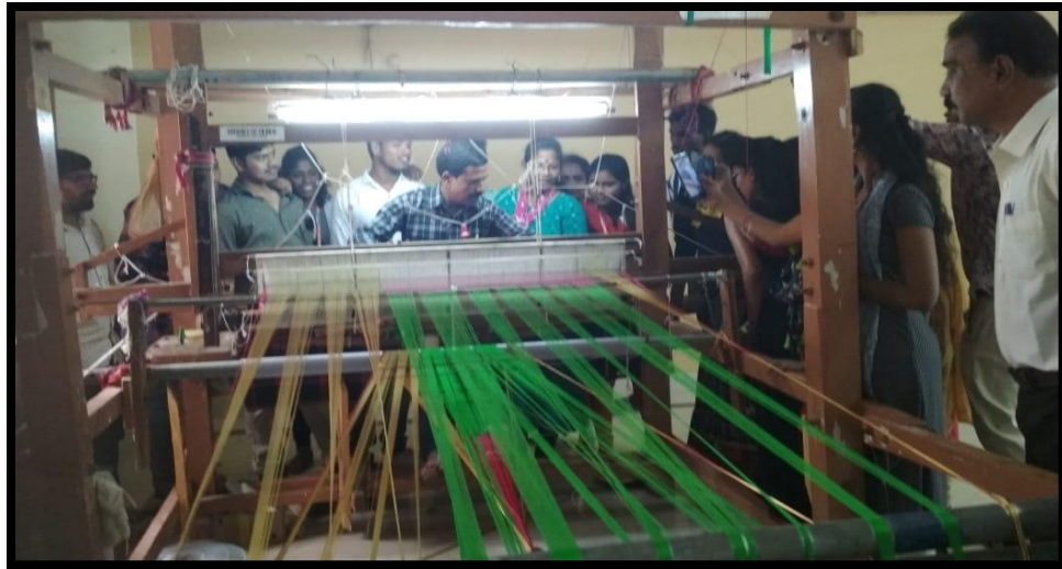
Live explanation of making an Ikat sarees by in charge of the Museum.