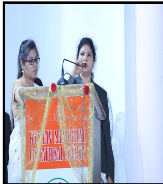
Department Heads gave a brief report About Dept. activities and achievements