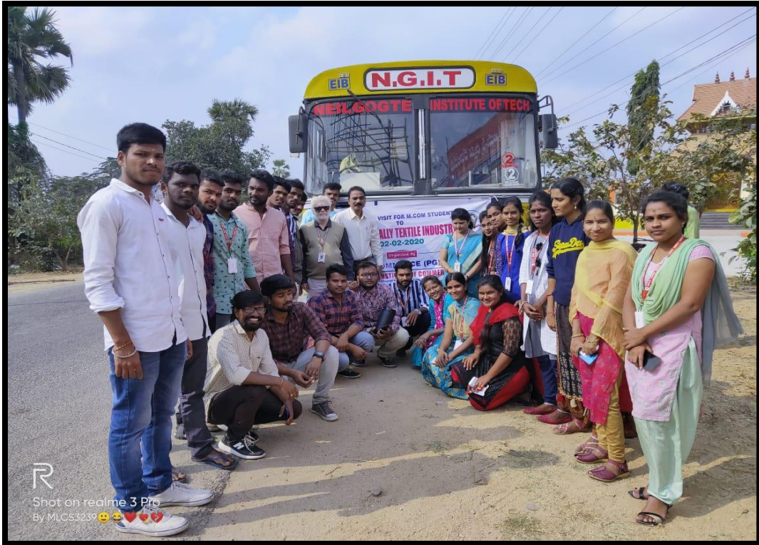
Educational Tour to small scale Industry.