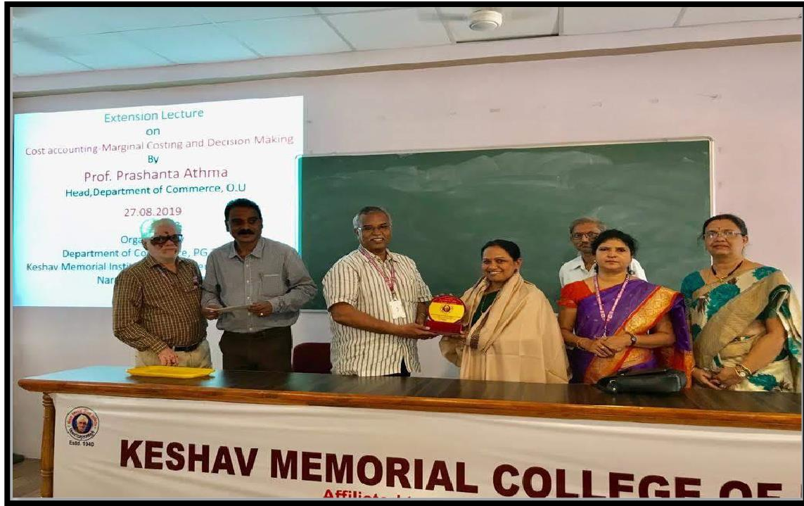
Felicitation to Chef Guest.