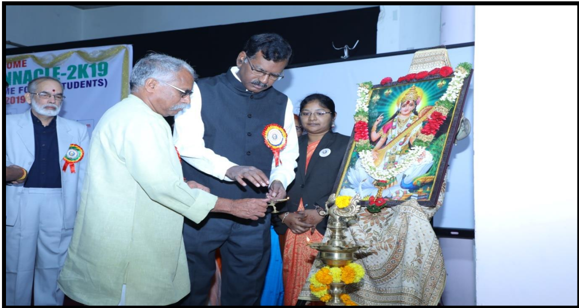
Traditional lamp lighting ceremony to Goddess of knowledge saraswathi .